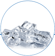
Freezer at the bottom